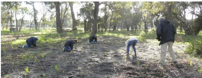
A small but enthusiastic group of planters.

This day saw seven volunteers brave a couple of showers to help the City of Canning's Natural Areas Team plant 2,000 seedlings. Though few in numbers, we were full of enthusiasm.