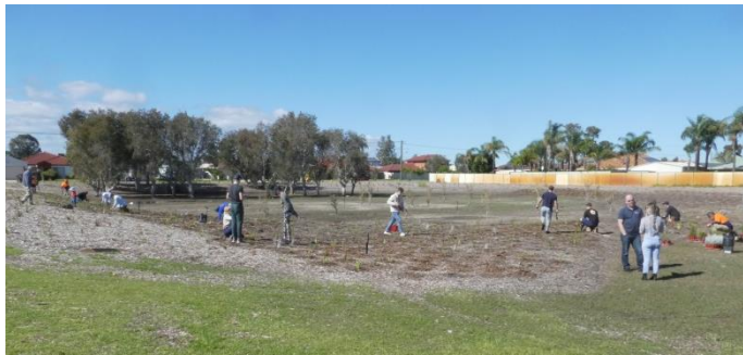
Planting at Groundlark Park.

With a few weeks of drier weather, Groundlark Park was no longer doing double duty as a compensation basin and the water had drained away. Lots of volunteers joined Greening Australia and the City of Canning to get another three thousand plants in the ground in three hours.