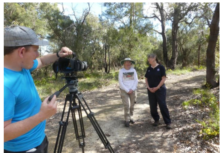
Filming Caring for Country - Our Way for Sister Kate's Home Kids Aboriginal Corporation.