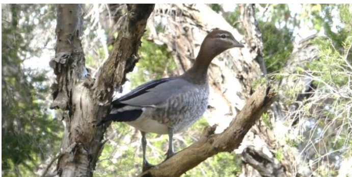
An Australian Wood Duck looks at the work being done.

As well as the sense of satisfaction that comes with giving a plant a forever home, planting gives you the opportunity to find out what lives in and under the ground. We took time out to observe a blind snake and the native millipedes that were disturbed by our activity.