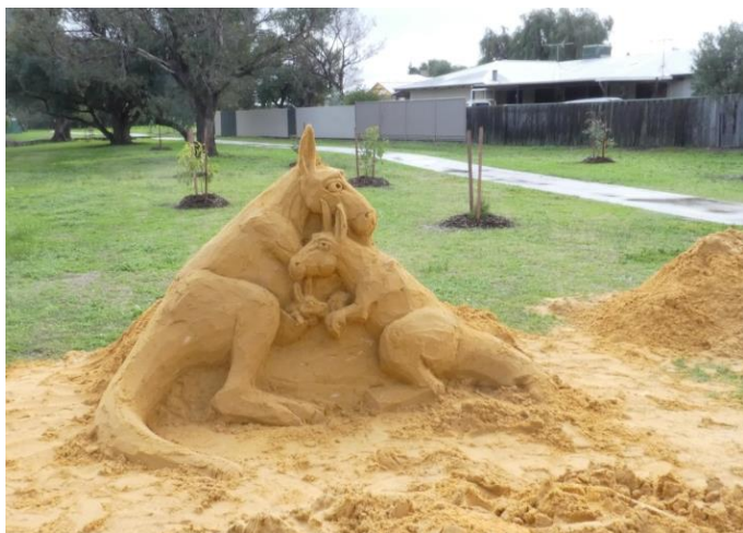
The finished sand sculpture and some of the trees that were planted at Mary Mackillop Park.

Even though it was cold and wet, everyone had a great time. There were some kids who were soaked through, and so cold their lips had turned blue, but still wanted to stay and enjoy the activities.