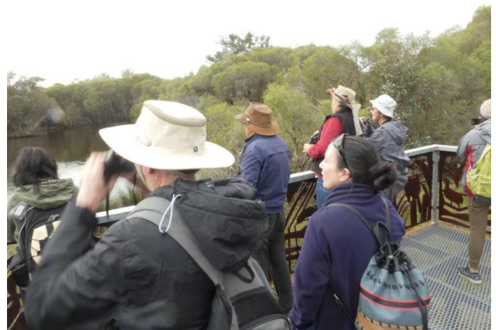
Birdwatchers look for waterbirds on the lake.

Everyone agreed that the birds that made a lasting impression were the Red-Capped Parrots as they stayed still and out in the open long enough for everyone to get a good look.