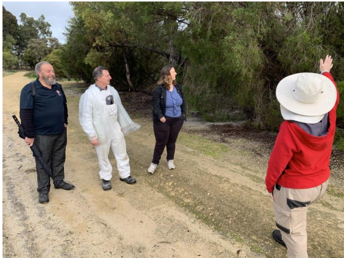
Community members enjoy a guided walk.

We also watched a Galah take a sprig of Eucalyptus leaves into a hollow. Eucalyptus leaves act as an insecticide and are used by birds to help keep the nest free of parasites.