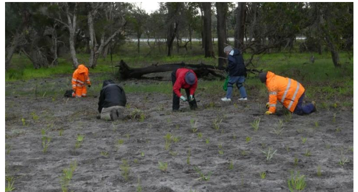
Planting with the City of Canning's Natural Areas Team.

Six volunteers, including two City of Canning councillors, helped Canning's Natural Areas Team plant another 1,800 seedlings.