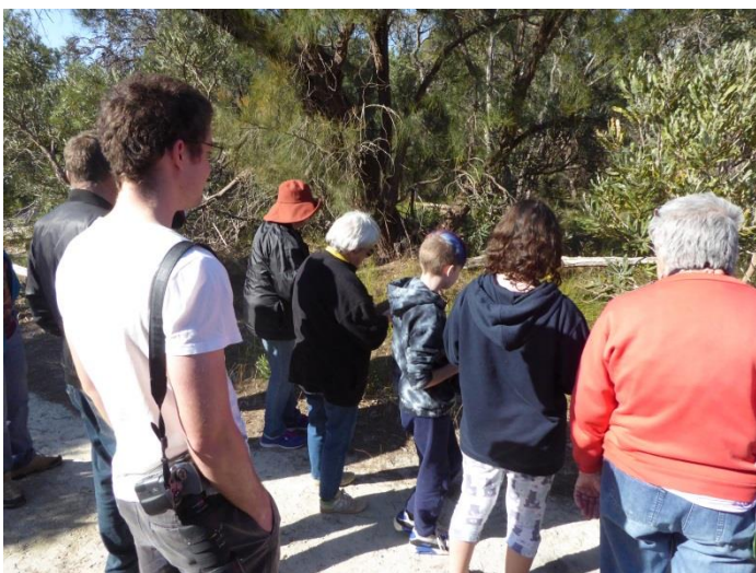
Looking at a Bobtail, Tiliqua rugosa .