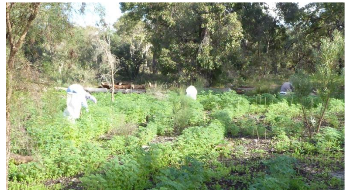
Weeding amongst the lupins.

Five of us met to remove weeds from around some of our seedlings. Our experimental lupin crop, to build the nitrogen content of the soil, was just starting to flower. As we don't want them to set seed, all of the flowers were nipped off ready for the plants to be pruned down to the ground at a later date.