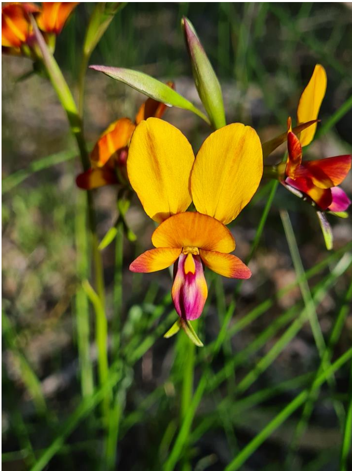
Many Pansy Orchids, Diuris magnifica, were seen on the walk.