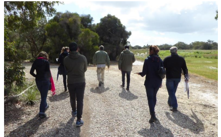
One of the feedback walks.

Two walks through the study area were held so that respondents could get a better feel for the design and feedback could be given straight to the designers.