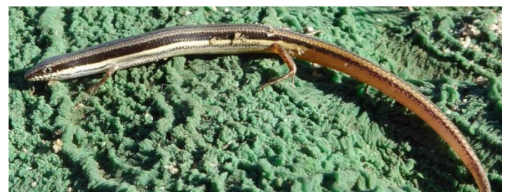
A new species for our reserves, Lerista elegans , West coast four-toed lerista.

We found a skink while weeding which, unbeknownst to us at the time, was a new species for the reserves. It is very similar to one previously found so it wasn't until the photos were downloaded that the skink's true identity was revealed.