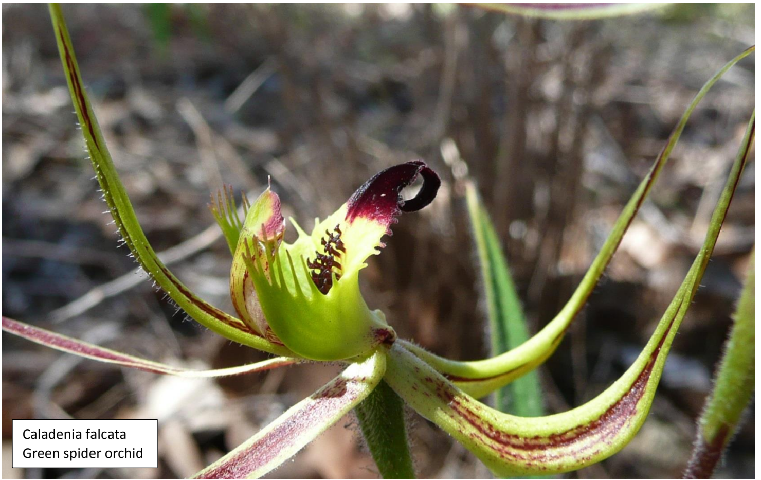
Caladenia falcata Green spider orchid