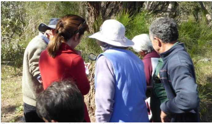
Examining the leaves of Allocasuarina fraseriana .

The end of the walk held some difficult decisions to be made. Fortunately everyone was able to establish their own balance between having morning tea and photographing more orchids.