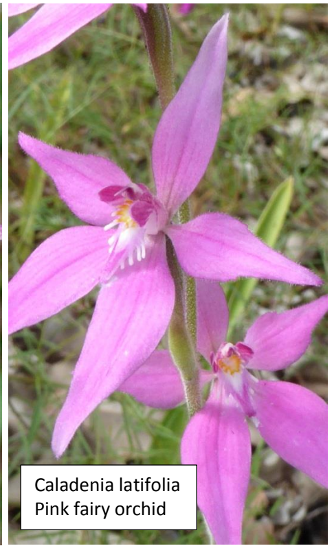
Caladenia latifolia Pink fairy orchid