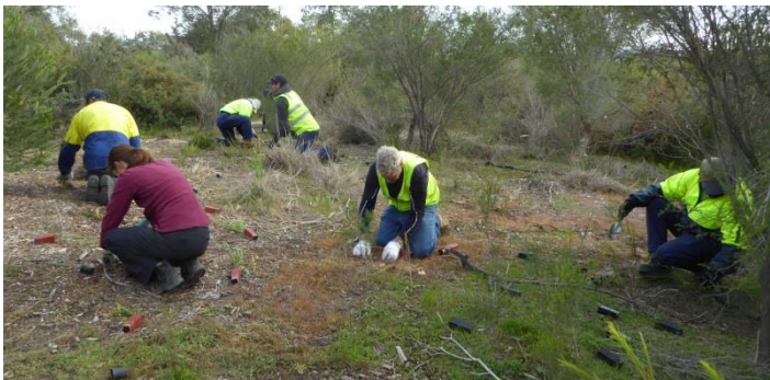
Planting with the City of Melville staff.

Thanks go to the City of Canning for organising this day.