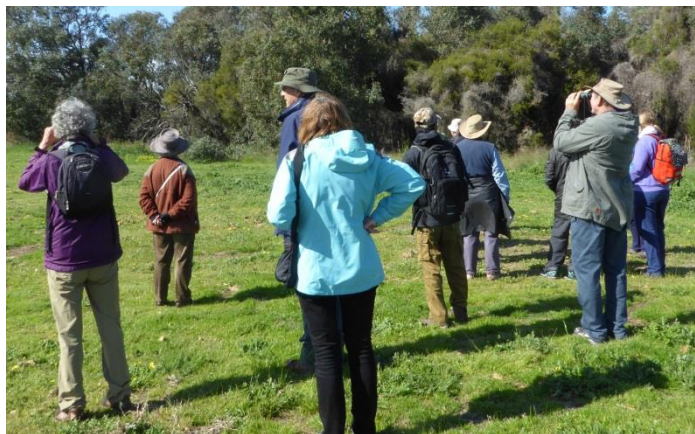
Everyone stops for the Eastern great egret (just out of shot).

Red-tailed Black Cockatoos were the most numerous of the six species of parrots seen with groups of three to 15 seen regularly throughout the morning. However the skeins of 50 or more Straw-necked Ibis took out the prize for largest individual flocks. As is usual in our bushland, Brown Honeyeaters won the 'most incessant call' competition.