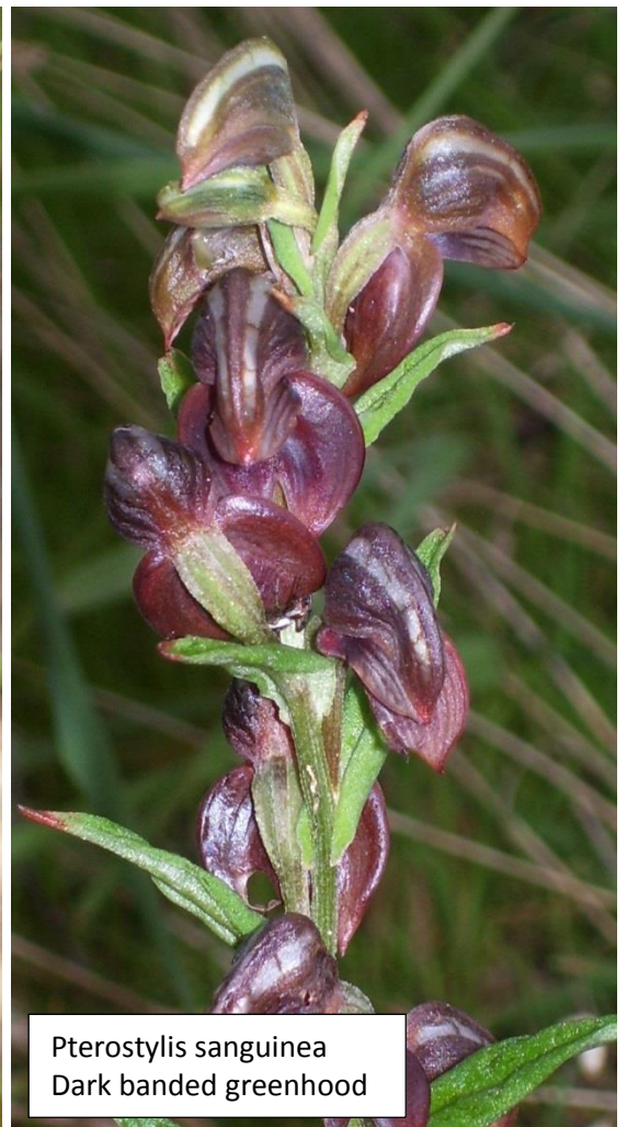
Pterostylis sanguinea Dark banded greenhood