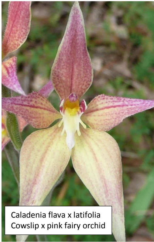
Caladenia flava x latifolia Cowslip x pink fairy orchid