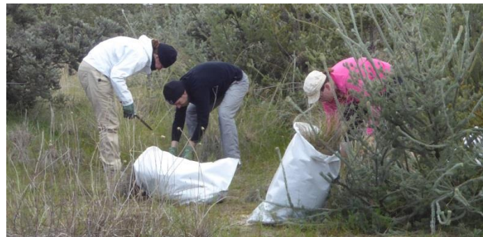
Weeding African lovegrass (again).

We checked out the orchids seen in July and found they were starting to look a little past their best. However, we saw a further three species that weren't flowering in July – donkey orchids, pink fairy orchids and cowslip orchids.