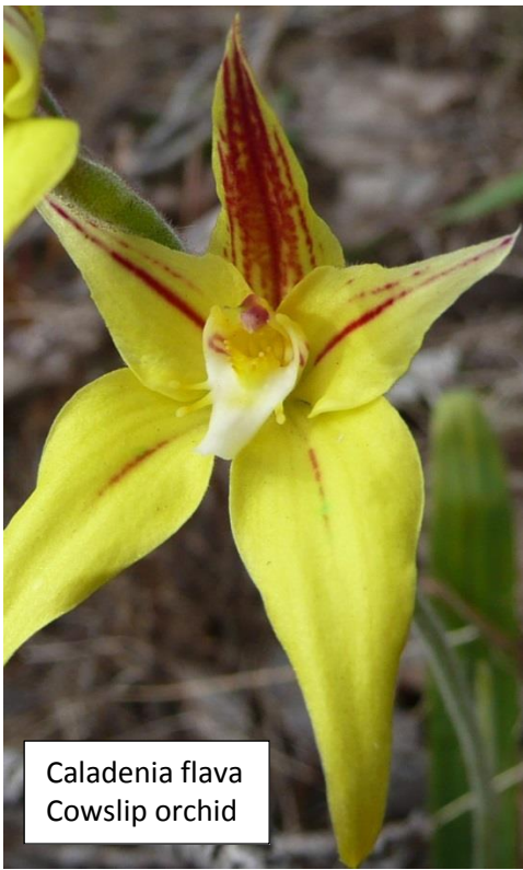
Caladenia flava Cowslip orchid