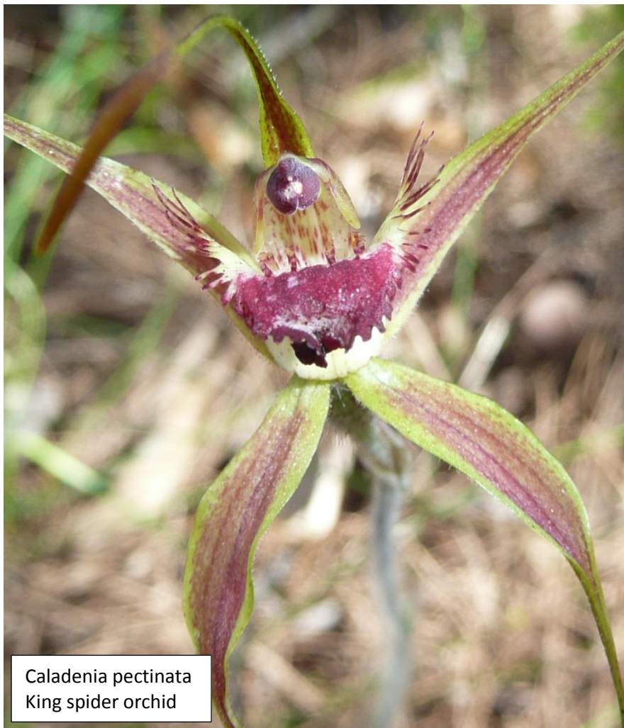
Caladenia pectinata King spider orchid

The early and consistent rains this year have led to a wonderful orchid display. These are some of the species we've seen this quarter.