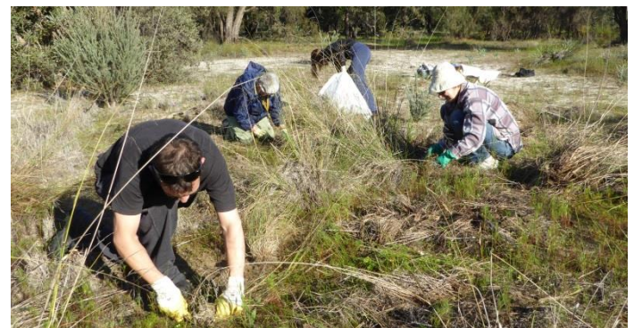
Weeding African lovegrass.

Despite the near freezing minimum overnight, seven members enjoyed a sunny day to weed African lovegrass.