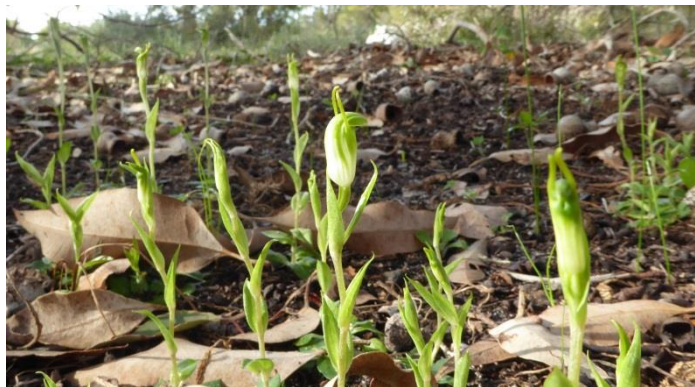
Short-eared snail orchids.

Underneath a Marri tree a drooping branch cleared a small area as it swayed back and forth in the wind. Growing in this cleared area was a group of snail orchids. The orchids were about 8cm tall and almost exclusively found in the cleared area.