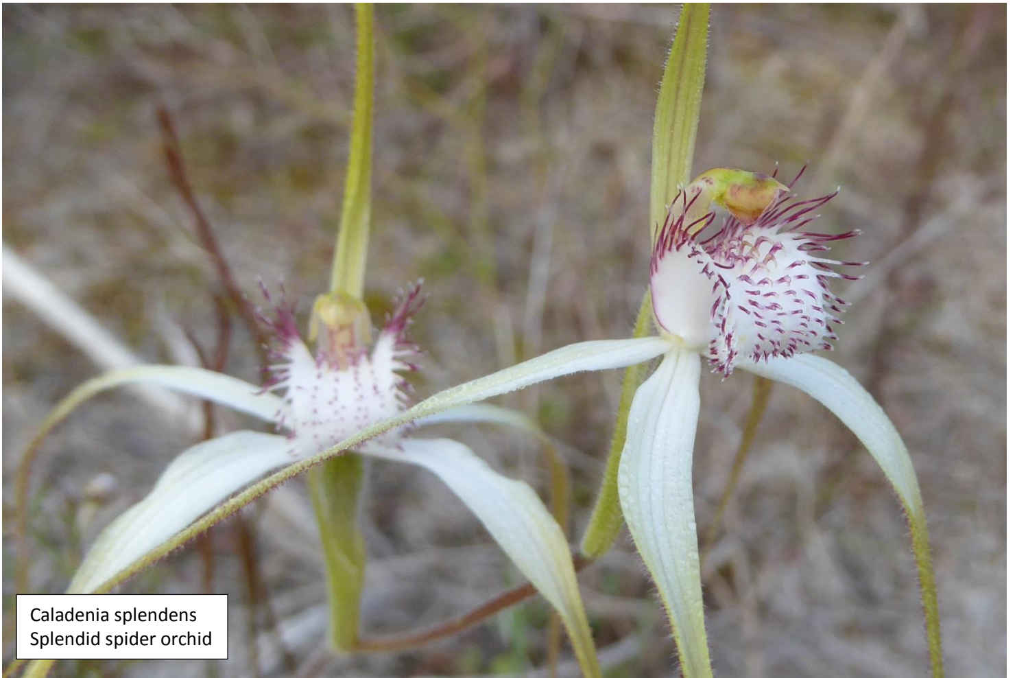
Caladenia splendens Splendid spider orchid