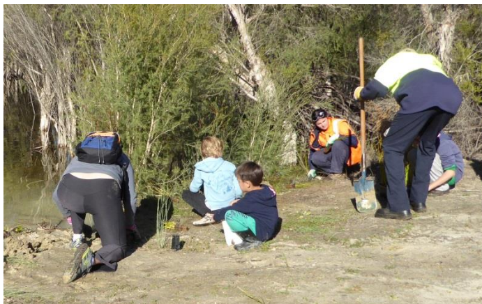
Planting sedges at the edge of a lake.

While being cold left us not being able to feel our fingers, it also meant that the ants were not active. This was fortunate as we were able to plant close to their nests and trails without being attacked.