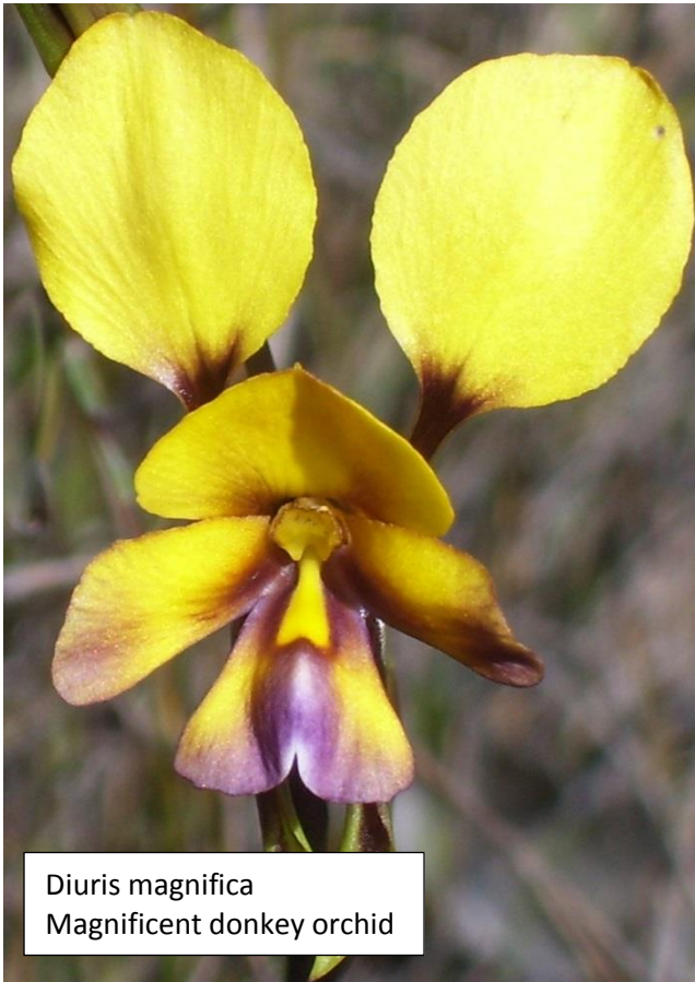
Diuris magnifica Magnificent donkey orchid