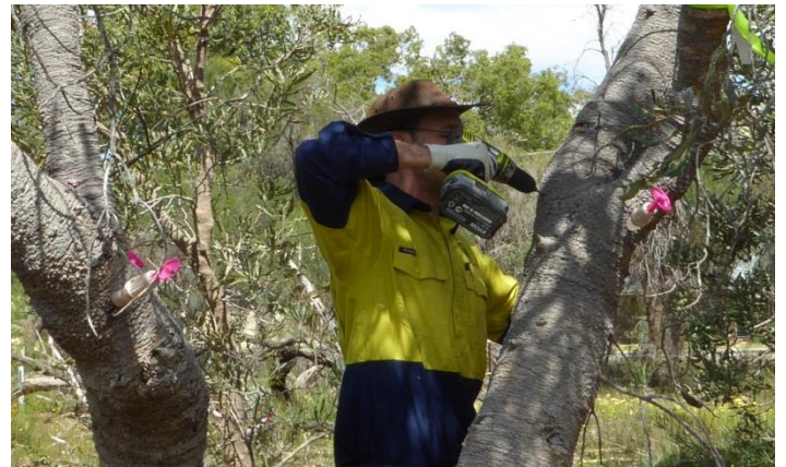
Injecting a tree with phosphite.

The trees in the dieback infected areas were injected with phosphite and the understorey vegetation was sprayed. With any luck this will keep the disease at bay until the next treatment.