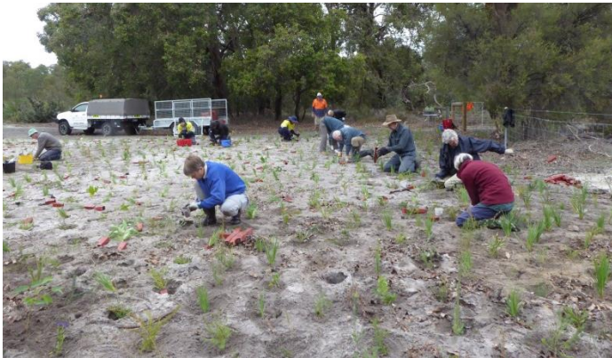
Volunteers from the Canning River Regional Park Volunteers helped out during the planting effort.

On the first day around a dozen Canning River Regional Park Volunteers joined us and we had all of the day's plants planted by 11.00am. Some of the CRRPV volunteers helped out on subsequent days which, along with our own volunteers and three City of Canning councillors, saw all of the plants in the ground three days ahead of schedule.