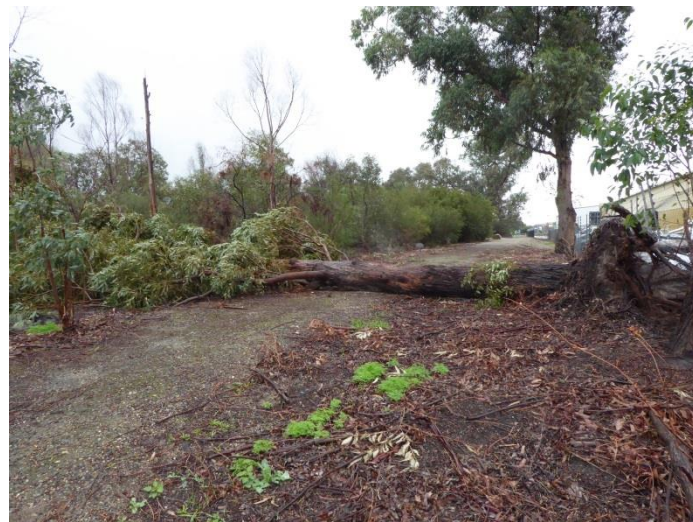
This introduced eucalypt was uprooted and fell across an access track.

Branches were broken from many plants in the bushland and at least three trees were toppled. One, an introduced species, was pulled from the ground. As it fell across a firebreak it will need to be cut up with the logs being retained for habitat purposes.