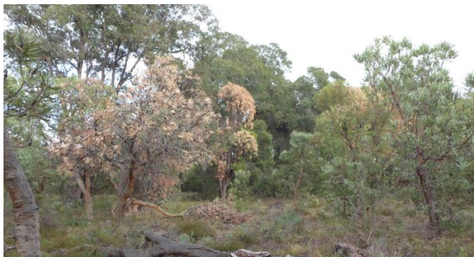
Dead and dying trees.

Regrettably, it has become commonplace for us to see the understorey plants die off in autumn but this is the first time we've seen the established trees suffering to such an extent. The deaths have involved several species and have occurred in patches rather than a single tree here and there. This suggests that the ground under the dead patches has changed more than the surrounding area. What has changed is not known but it could be that the soil has dried out more than the surrounding area or that the groundwater level has dropped further.