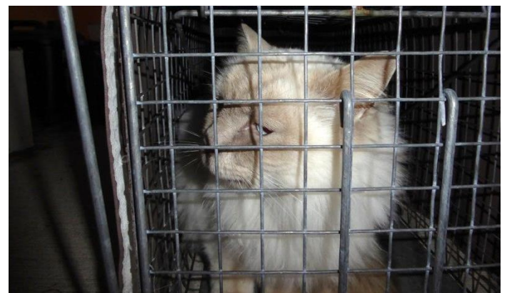
A trapped cat.

You can see the local laws and provide your comments by 20 August at https://www.yoursaycanning.com.au/local-law-review