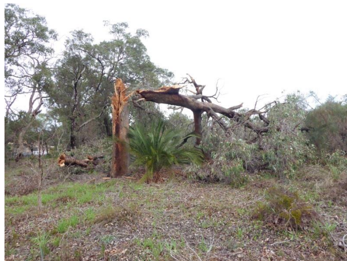
This Marri had its trunk snapped about 2.5 metres above the ground.

Another tree, a Marri, Corymbia calophylla , was snapped off at about 2.5 metres above the ground. At this height the tree is 50 centimetres in diameter. This tree is in the middle of a reserve with no public access so will be left as it fell. We will need to wait to see if the trunk survives and sends out new branches.