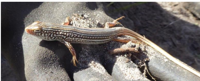
A cold and sleepy West Coast Long-tailed Ctenotus brightened the day.

It wasn't just the humans helping with the planting – a couple of spiders and a West Coast Long-tailed Ctenotus, Ctenotus australis , kept us entertained along the way.