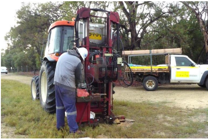
Digging a water monitoring bore.

A huge revegetation activity took place in our area over eight days from 15 to 25 June. Our thanks go to the City of Canning's Natural Areas Team, SERCUL staff and plenty of volunteers for their combined efforts to get 24,000 plants in the ground.