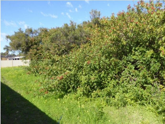
Above – In 2019 there was a wall of Brazilian Pepper.

The photos from today may look a little bare in comparison, but those lush weeds were pushing out the natives. It will take a while for the natives to reclaim their rightful spot.