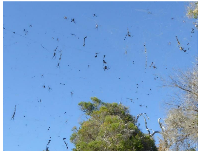
The larger dark points are female of Australian Golden Orb Weaver spiders. The males are too small to see in this image.

vegetation beneath, so we wouldn't be caught as we walked along a path.