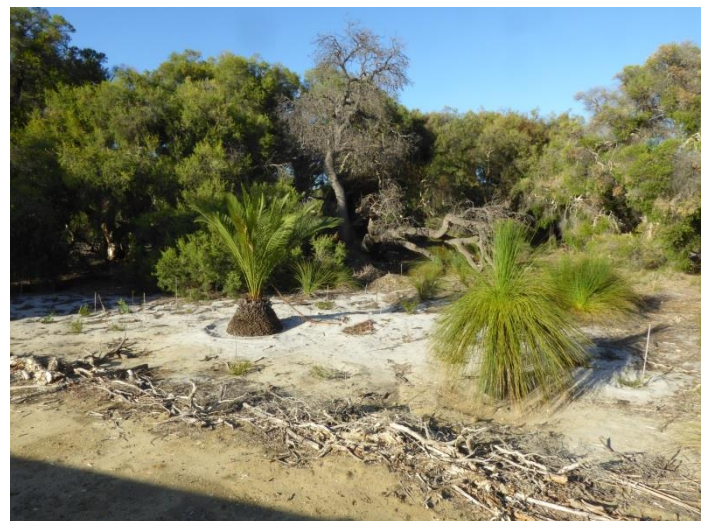
Below – Unfortunately the Banksia in the middle of the photo didn't survive the summer of 2023-24. But, with the grasses removed, revegetation efforts have begun with a translocated Zamia and Grass Tree. There are also seedlings in this photo but they are still too small to see.