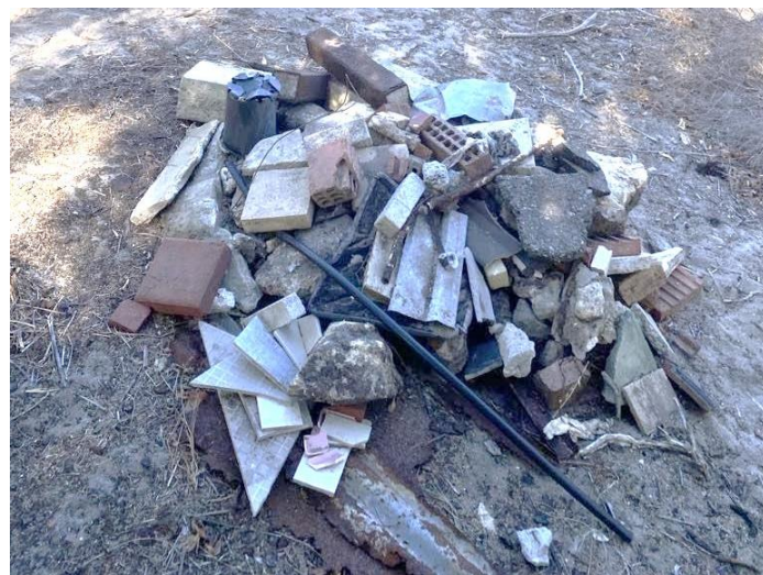
Some of the rubbish.

Speaking of rubbish removal , over summer we collected a substantial amount of rubbish and rubble from this same reserve.