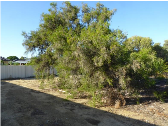
Below – With the Brazilian Peppers removed, the Melaleucas can start to reclaim the land.