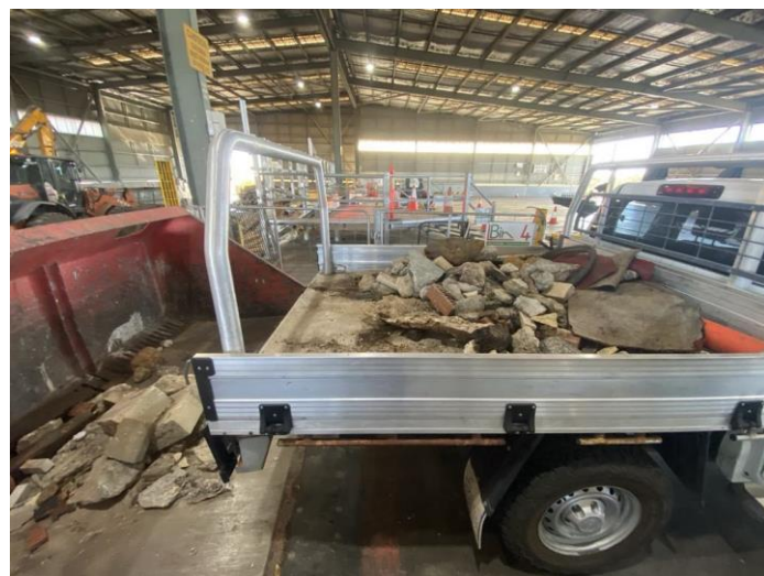
Rubble being unloaded at the waste transfer station.