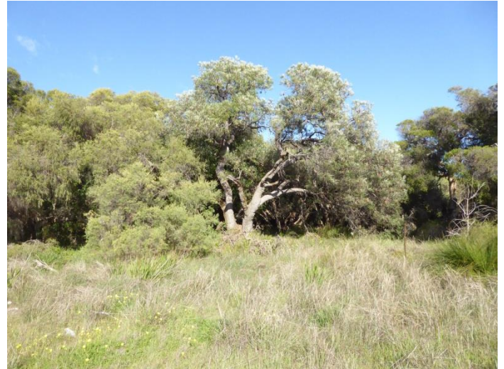
Above – In 2019 weedy grasses covered the foreground.